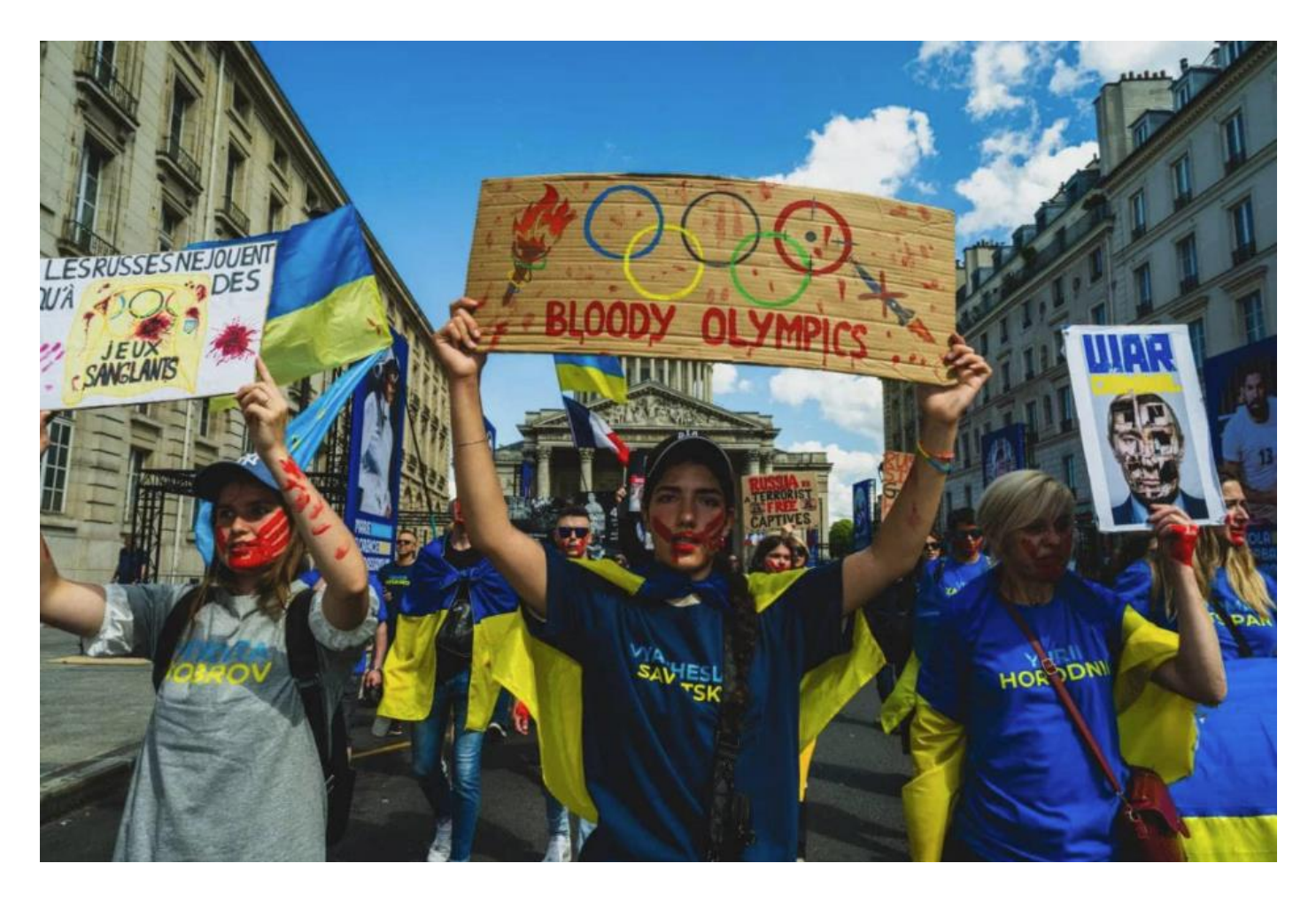
July 13, the Union of Ukrainians in France gathered 1,000 people in Paris for a peaceful march in memory of 488 Ukrainian athletes who died during the Russian invasion of Ukraine. Participants wore T-shirts with the names of the fallen Ukrainian athlettes